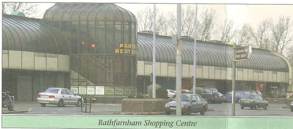
Rathfarnham Shopping Centre

An appeal was lodged with An Bord Pleanála against the Department's decision to grant permission to CFI Property Management Ltd. For development comprising alterations to the permitted plans for the partial refurbishment and upgrading of the Rathfarnham Shopping Centre. The scheme no longer permits the upper-level car parking deck over existing shops and omits the permitted basement car park.