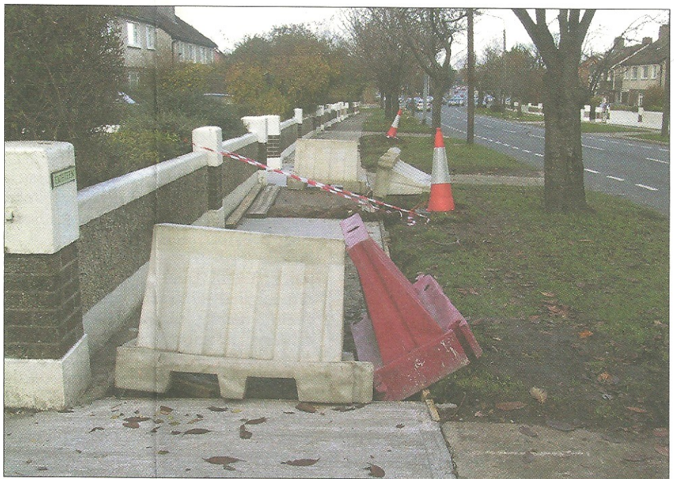
Footpath repair on Ballyroan Road - I am seeking additional funds for 2003.

There were three separate contracts carried out on the Knocklyon Road this year: (1) The new footpath and realignment of the