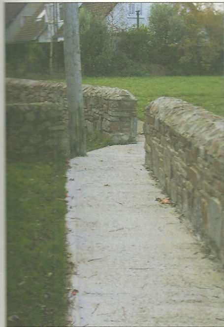
The granite wall at Marian Crescent which cost nearly £5000. With the support of myself and the local community, we enhanced what had become an eye-sore.

shifted onto adjoining neighbourhoods. The new county manager has committed to allocating funding for traffic calming next year and I am pressing the Council to prioritise certain areas with a view to relieving the problem of rat-running in particular. The Council, through its Strategic Transport Policy Group, of which I am a member, is also examining alternatives to ramps and speed cushions. In the meantime, I have asked that the roads surfaces within the Butterfield Traffic Cell, some of which are fifty years old, be examined with a view to having the surfaces re-instated where necessary. The Roads Department has agreed to carry out an examination of these surfaces.