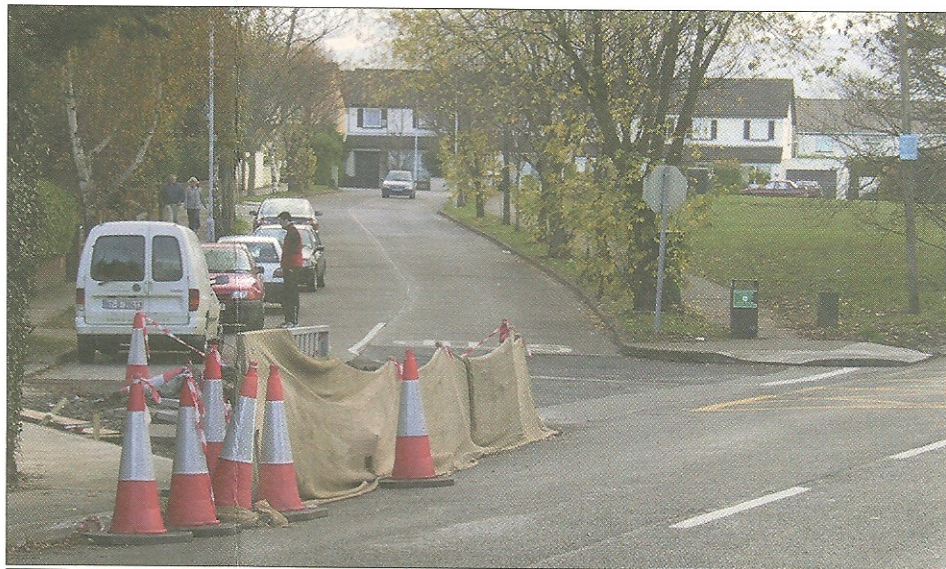
Improvement works being undertaken at Entrance to Knockcullen/Ashton. This has been years in the waiting. The residents are now looking for an Entrance Stone/Sign for the area and I will be prioritising this for 2003.

Department of Education and Science has agreed to pay for the installation of much-needed new windows.