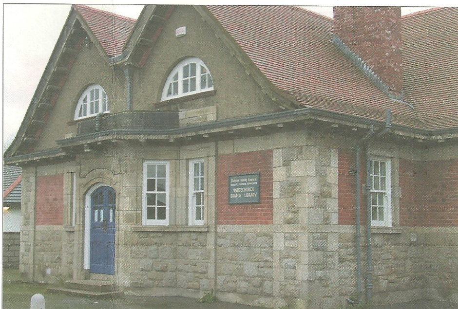
The Carnegie Library on Taylor's Lane - There are many local Ballyboden and Whitechurch activities held here, including the new Citizen's Advice Bureau

New school windows for Ballyroan Boys N.S. Major refurbishment works are needed at Ballyroan Boys N.S. In the interim, the