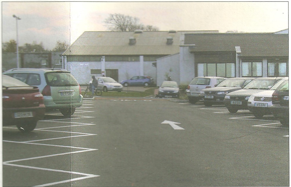
The new car parking system at St Colmcille's JNS and SNS

The Council Roads Department considers the roads in the Butterfield area (Butterfield, Pinewood, Marian, Fairbrook, Edenbrook, Willowbank, Anne Devlin, Silverwood, Orchardstown, Ballymace) as one single traffic cell. While the traffic calming measures on Butterfield Park some years ago have been successful in reducing traffic speed on that road, the problem has simply