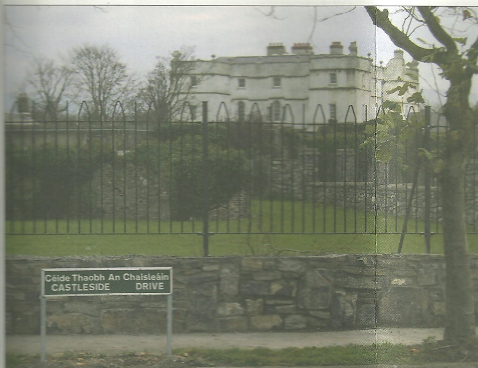
Rathfarnham Castle Park - New wall and railings

I have been providing an e-mail newsletter to constituents for a long period now, and if you would like to receive a regular update on local developments, please e-mail me your address and I would be happy to add you to my database.