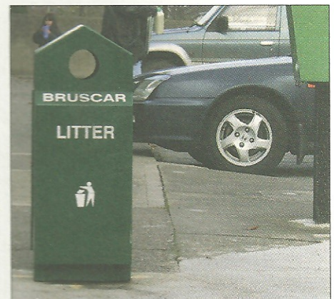
One of the new litter bins - There are never enough litter bins to meet demand.

New bins were installed on the route to school from the shops at Marian Road to Coláiste Eanna and Sancta Maria earlier this year and brings to 16 the total number of bins in the locality. The cost of purchasing these bins was borne by the local traders and the Council services the bins. Three new litter bins were installed on Scholarstown Road. The Litter Warden has, at my request, asked the local supermarket to install a bin in the vicinity of the supermarket which will be serviced by Council staff if necessary.