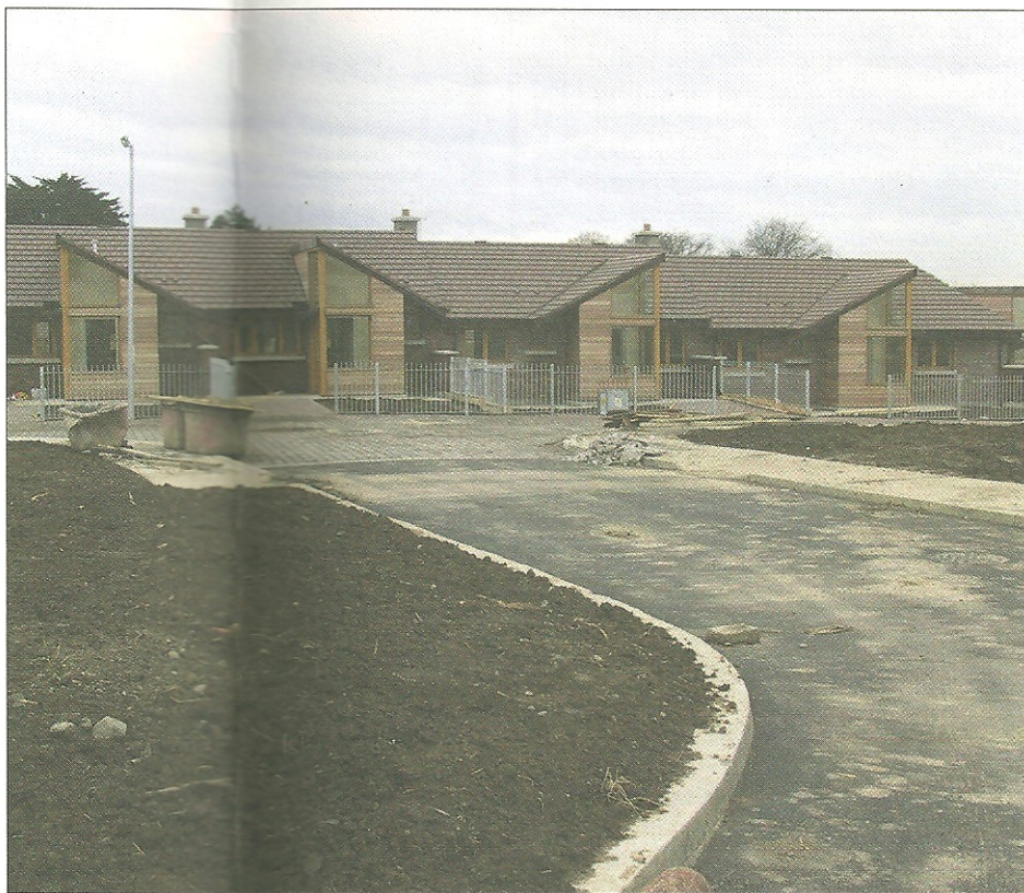
Some of the council/social housing under construction at Taylor's Court, Ballyboden

Traveller accommodation consists of 8 day houses and caravan bays for eight families. The permanent caretaker and the families have moved on site in November.