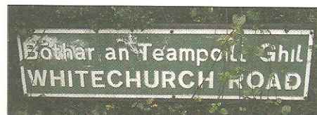
The council propose to put new speed limiting "Roundals" on Whitechurch Road, to reduce the speed of the traffic

Both Tom Kitt T.D., Minister of State, and myself hold clinics at the Ballyboden Resource Centre on the first and third Friday of each month.