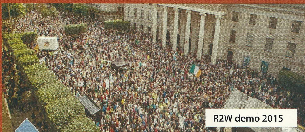
R2W demo 2015

The crises in these areas are not an accident. The obvious solution of building public housing is not being pursued for one reason only. It clashes with the interests of banks, property developers, landlords, estate