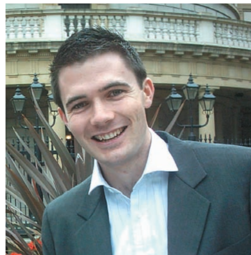
the Fianna Fáil Northern Ireland Committee, Minister for Foreign Affairs, Dermot Ahern TD.

The success of our recruitment was clearly in evidence at the 69ú Ard Fheis on October 21st and 22nd in Killarney, Co. Kerry. With several hundred Ógra members in attendance, the story of the weekend was the level of interest and involvement of young people in Fianna Fáil. Ógra members participated at all levels over the weekend, from proposing some forty-nine motions on the Ard Fheis Clár, to participating in much of the debate on the floor, and having five candidates in the Committee of Twenty election. The Ógra presence was consolidated with the distribution of a special Ard Fheis edition of Grassroots and a central stand outside the main hall, where members also raised money for the Special Olympics. National Youth Committee members also initiated a petition over the weekend calling for Fianna Fáil to organise on an all-island basis. This became the central theme of the Ógra Fringe Meeting on the Saturday of the Ard Fheis where there was quite heated discussion on the topic with Chairperson of