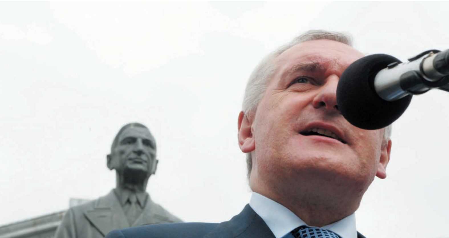
Photo : An Taoiseach Bertie Ahern TD speaking at the Annual deValera Commemoration 2005, Ennis.