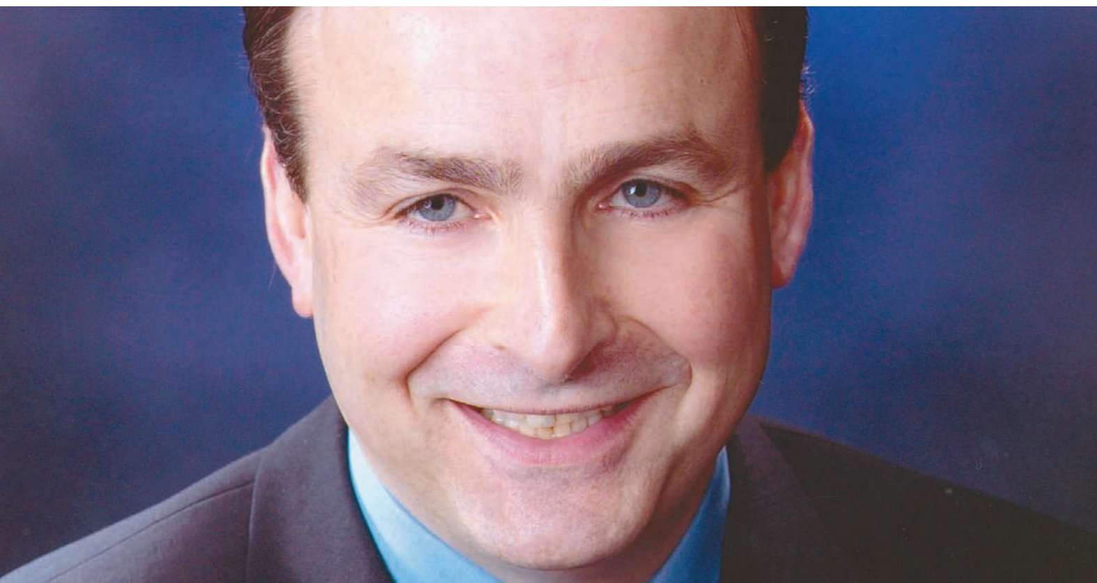
Photo : Minister Micheál Martin TD.