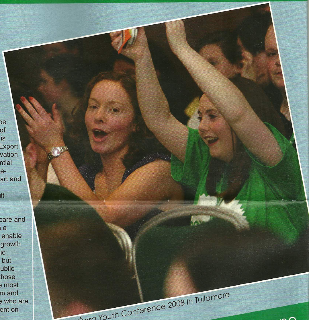
At the Ógra Youth Conference 2008 in Tullamore

Fianna Fáil is also determined to show responsible leadership in the critical area of environmental sustainability. Nobody should underestimate the enormity of the task we