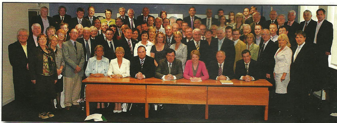
An Taoiseach Brian Cowen TD and members of the Ard Comhairle after a recent meeting.

This has serious implications for maintaining Fianna Fáil as an active force in urban areas. These Councils provide a good opportunity for young candidates to gain experience. It is also important that we address gender imbalance amongst Fianna Fáil Public Representatives and encourage more women to stand for election.