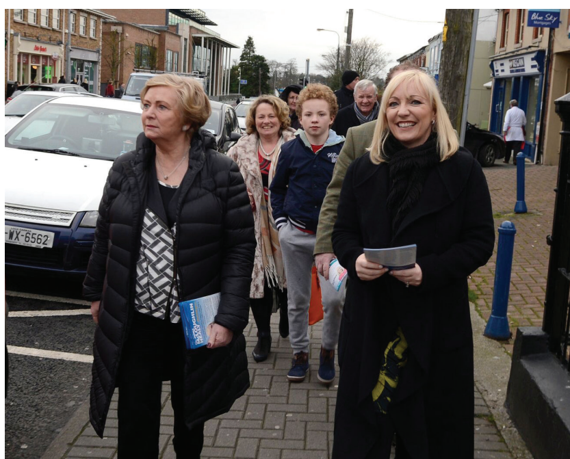
Showcasing Local Businesses with Minister for Justice Frances Fitzgerald

The latest Long Term Economic Plan wishes to abolish the USC by 2020 as part of Fine Gael's ambition to keep the recovery going. This time five years ago, people were feeling for the first time the shock of seeing the Universal Social Charge deducted from their pay checks. The introduction of the USC by Fianna Fail was the last act of a failed Government