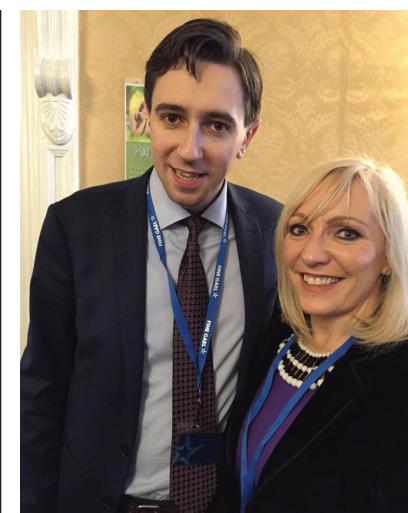
Discussing job creation and employment opportunities with Simon Harris

this bold ambition we need the right policy mix to help our enterprises grow their businesses and create more jobs. That is what the Action Plan for Jobs has done and that Action Plan for Jobs process will continue to be at the heart of our plans. We will fund an additional €4 billion in total capital investment over the five year period 2017-2021. The funds will be ring-fenced for a new 'Future Jobs Investment Fund' to future-proof the economy and our jobs plan against rising global risks and challenges."