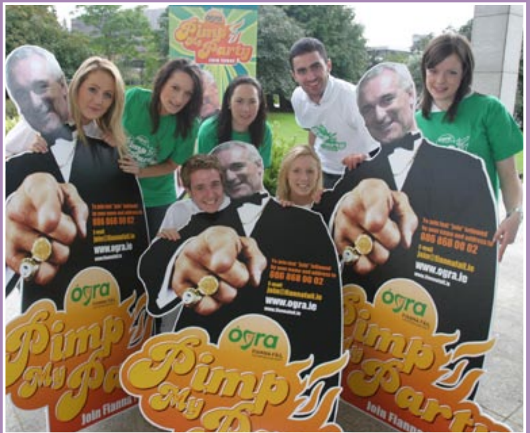
Members of the Kevin Barry Cumman at their campaign launch

Thanks to an innovative recruitment drive, Ógra Fianna Fáil has had its most successful 3rd level recruitment campaign in history. Ógra recruited more than 2,400 people through a national campaign which asked new members to 'Pimp my Party'.