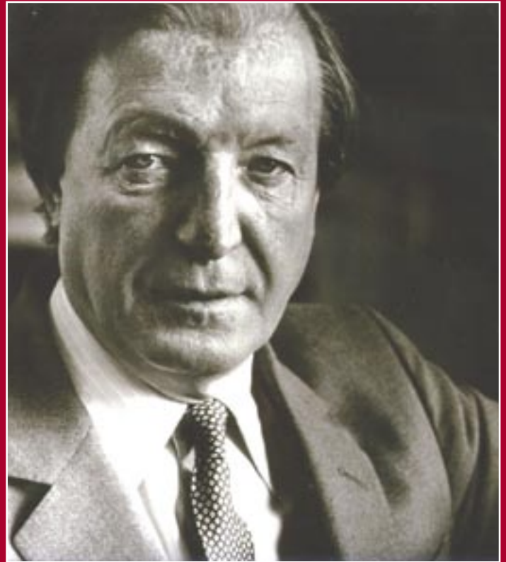
Charlie Haughey : rarely described Fianna Fáil as a 'political party'

Clearly, the most effective example of the promotion of Irish culture is the activities of the GAA. Conradh na Gaeilge and the many heritage groups up and down the country also spring to mind as examples of organisations in which Fianna Fáil