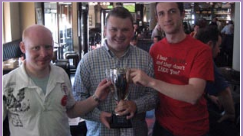
To the victors the spoils!

The tournament will be organised again next summer when it is hoped that this event will grow even bigger with many more teams participating.