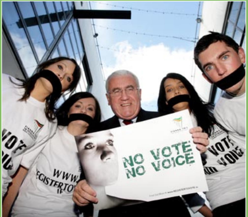
Minister Dick Roche helps launch the register to vote campaign

Speaking at the launch of the campaign, Brian said he would encourage all young people to check out this new website and to register to vote in an effort to ensure that the voice of young people across the country is heard.