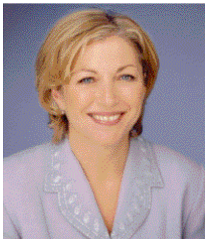
Dublin South TD, Liz O'Donnell 'Reform of the health service will be driven with one priority in mind: the patient.'

Hospital waiting lists have been cut dramatically over the last number of years through the success of the National Treatment Purchase Fund (NTPF), where the state pays for the public patient's treatment after six months on a waiting list. To date, over 21,000 patients have been treated. Waiting times for patients will be reduced further with an €20 million