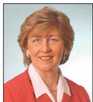
Councillor Cait Keane

Leinster House, Kildare Street, Dublin 2