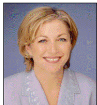
Liz O'Donnell TD