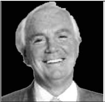
● Tony O'Reilly media baron grabbed £11 million in just one year.