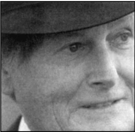
● Michael Smurfit CEO Smurfit Jefferson Group got £13.4 million last year.