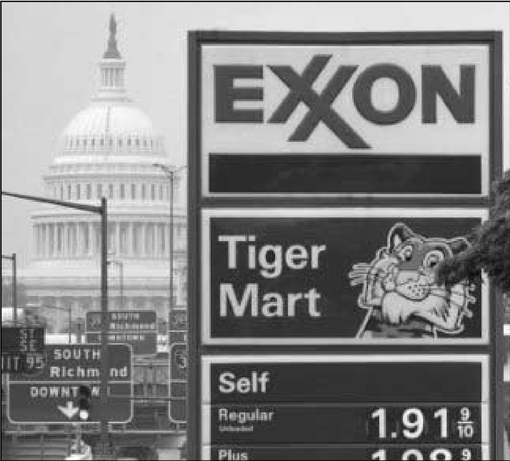
The power in front of White House