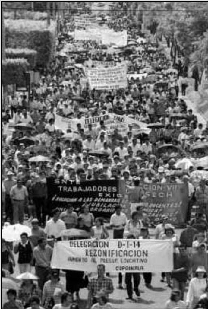
Thousands of teachers march in Chiapas as part of Mexico-wide strike for better pay.