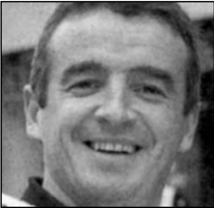
● Anti-union Ryanair boss Michael O'Leary made £37.2 million last year.